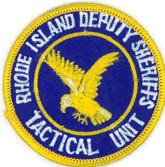
Worn 1980s – 1990s