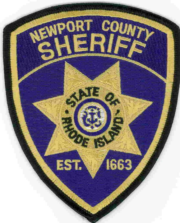
State of Rhode Island in Star