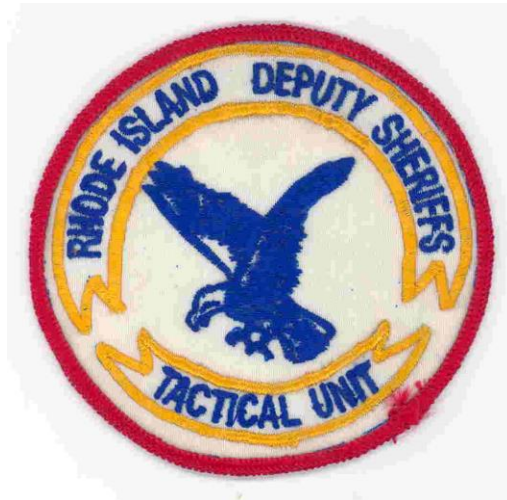
Worn 1960s – 1970s