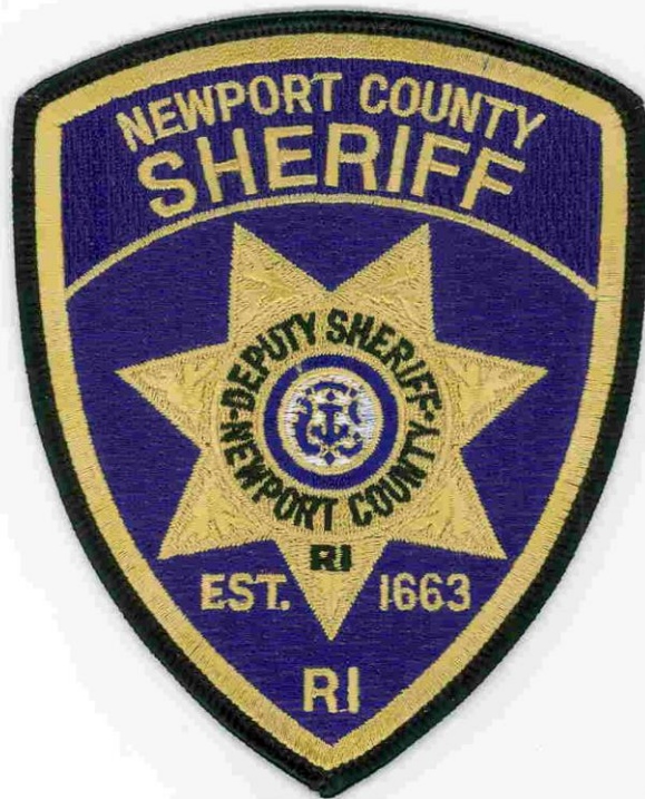
Newport County in Star