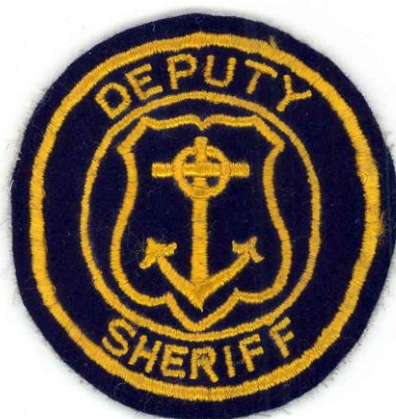
An early generic insignia made of black felt. Unknown dates when worn, probably 1950s.

The following fifteen pages show a progression of insignia worn by Rhode Island sheriffs over the years. The emblems range in date from the 1960s to 2011.