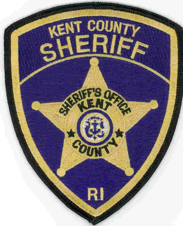
5 Point Star