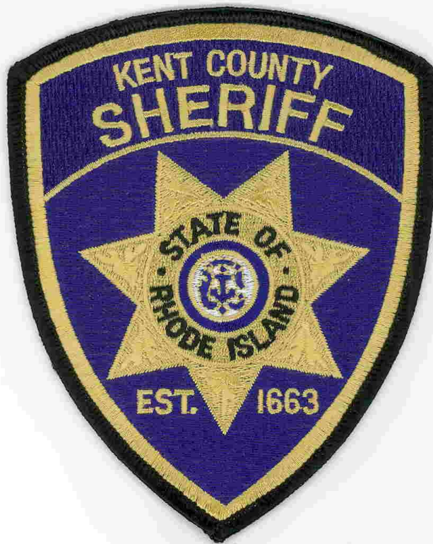
7 Point Star